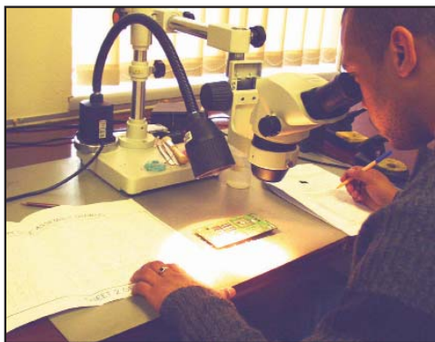
Assembly According to Customer Requirements