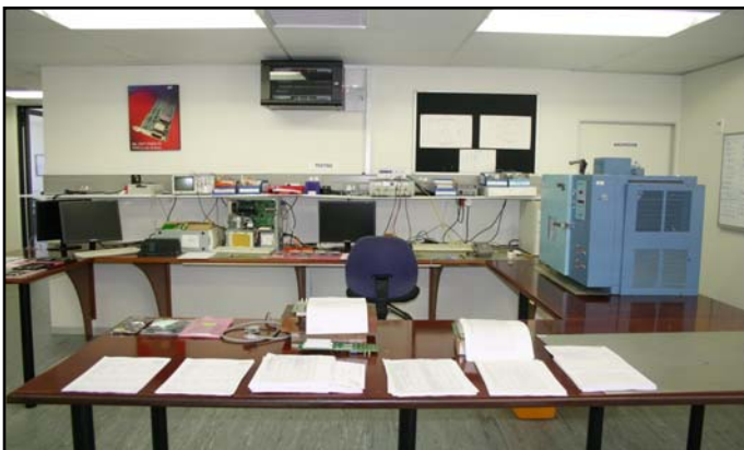
Product Testing Area