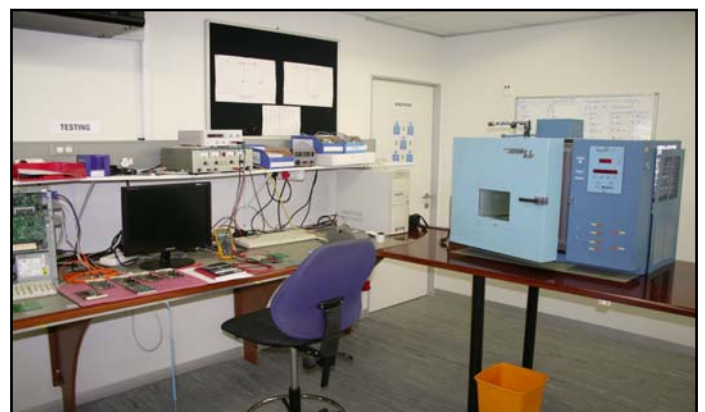
Environmental Test Chamber