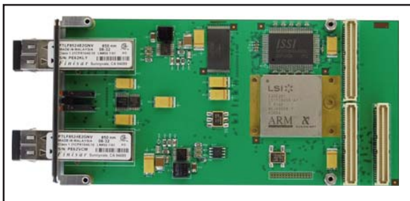
Dual 4 Gbps Fibre Channel PMC